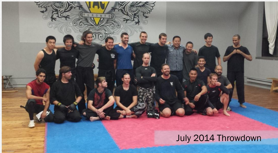
July 2014 Throwdown

Facebook Group ♦ Website (In Progress) ♦ Youtube Playlist